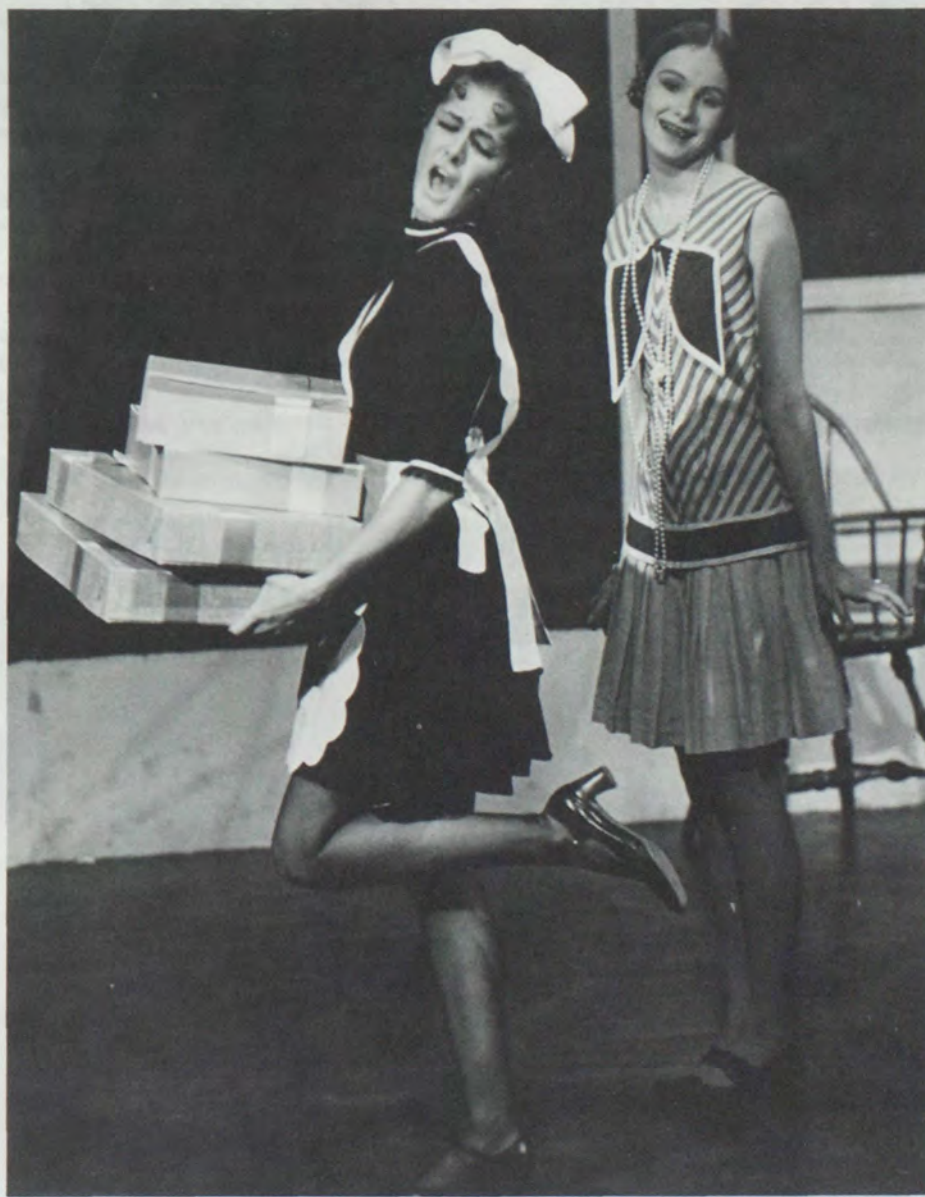
The Boy Friend 1970