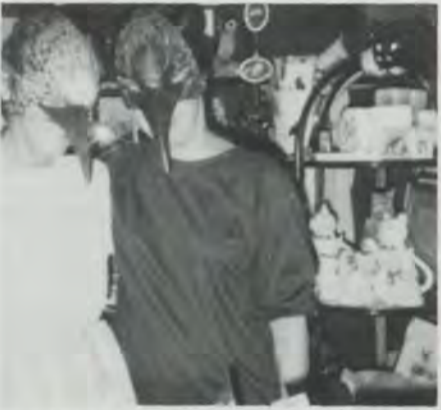
Two 1957 alumnae in French bird masks. See column for possible identities.