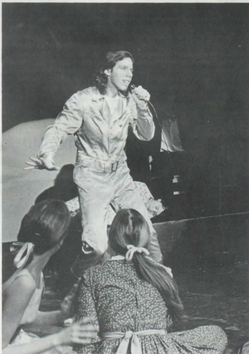
Bye, Bye Birdie 1973

★ ★ ★ Don't miss our star-spangled alumni revue on May 16th. ★ ★ ★