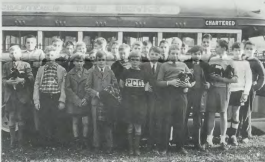
The 1941 soccer team prepares to board the bus for a game against Germantown Friends.